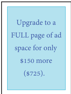
FULL PAGE 7.5" X 10.75"